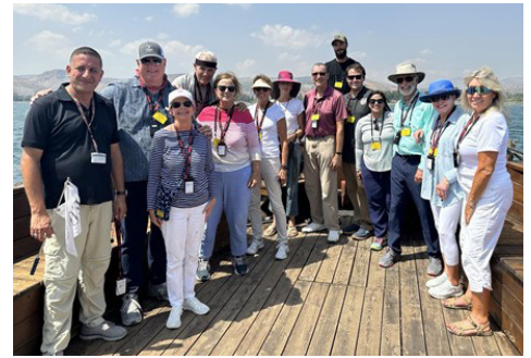
Sea of Galilee Boat