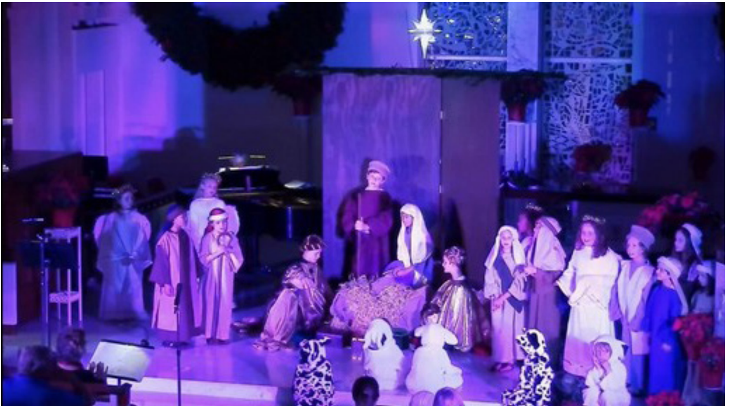
Christmas Pageant, December 11, 2022