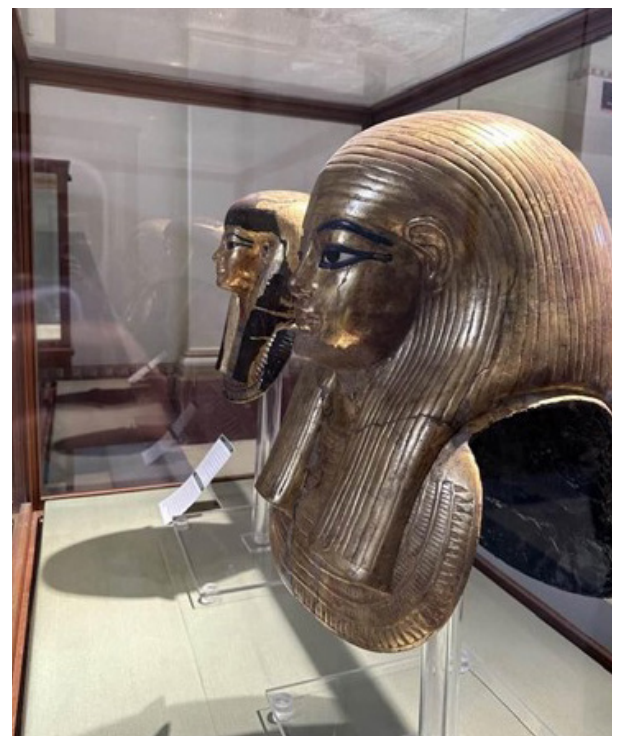
Egyptian Museum of Antiquities

From there we proceeded to Abu Serga (aka the Cavern Church of Saints Segius and Bacchus). This church is built on the site where the Holy Family lived when they fled Israel to hide from Herod's hunt for Jesus. The church is built over the stone cavern Jesus, Mary, and Joseph called home, and the well they pulled water from. It's a beautiful basilica with a great collection of icons from the 1200s to 1800s AD. We settled into a set of pews as our retired Air Force Chaplain led us in a reading and reflection on the importance of the Holy Family's retreat to Egypt to fulfill the prophecies, and God's presence and protection for all of us during times of crisis.