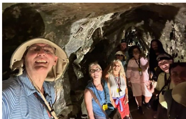
Megiddo Water Tunnel