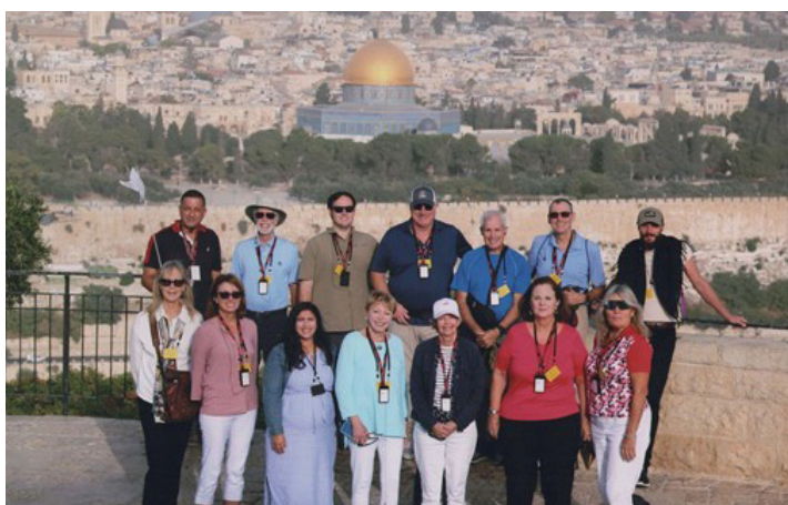
First Pres Explorers at Top of Mount of Olives overlooking Jerusalem

Tomorrow we trace the last steps of Christ as we travel the Via Dolorosa and complete our tour at the Church of the Holy Sepulchre.