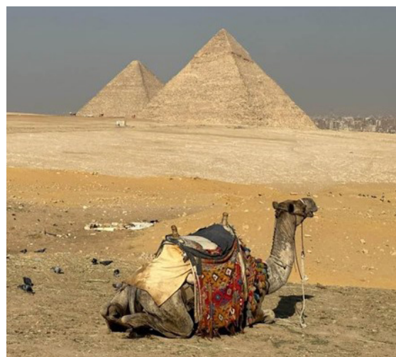
Great Pyramids of Giza