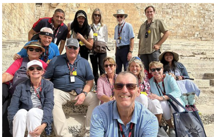
Temple Teaching Stairs