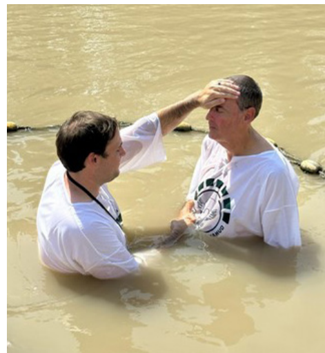
Reaffirming Baptism in the Jordan River