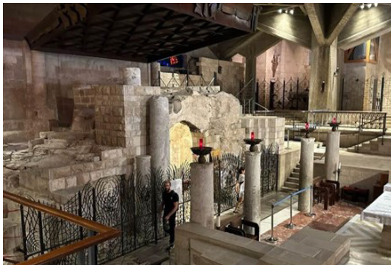
Virgin Mary's House at Church of the Annunciation