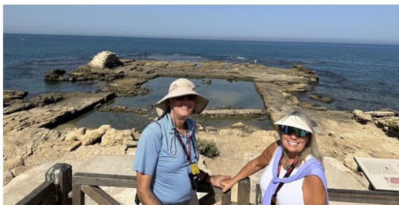
Caesarea National Park