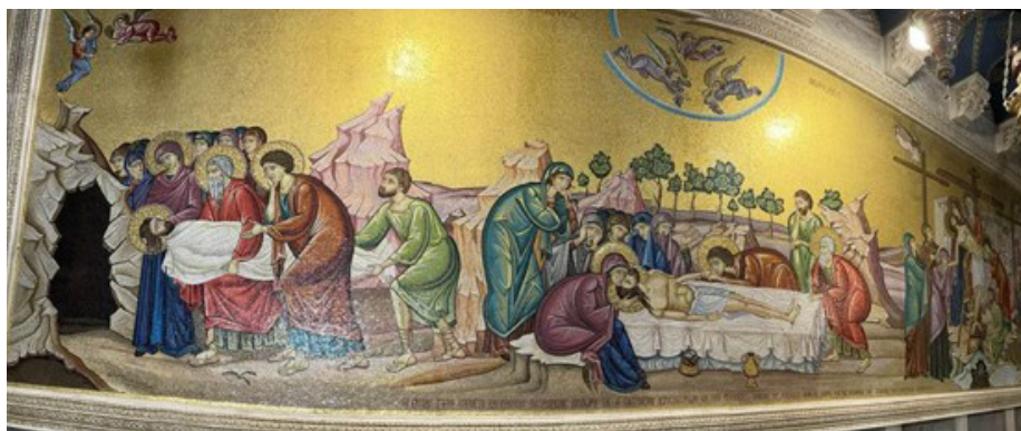
Church of the Sepulchre Entry Mosaic

T his is the amazing conclusion to the Israel portion of the trip. Most of our group will head back to the states tomorrow, but six of us will combine with two other groups and start a 3-day bus ride as we trace the path of the Holy Family through the Sinai Desert to Cairo.