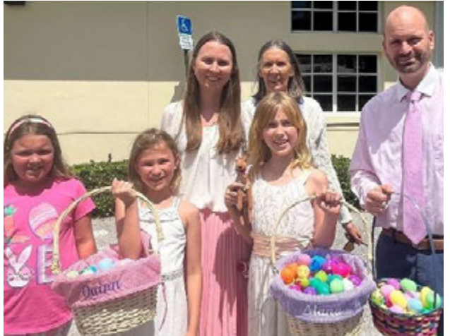
Easter and the Annual Easter Egg Hunt were highlights of the year.