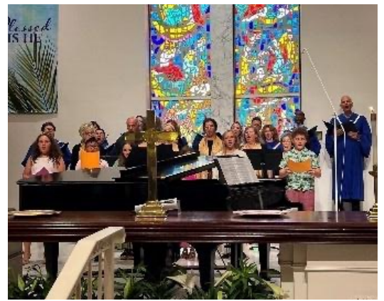
Music continued to be an important part of the lives of all the children