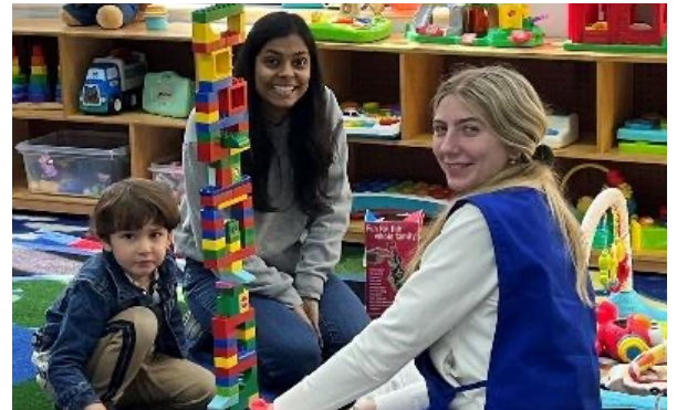
Our Nursery has been blessed with a number of Teen Volunteers who are caring for our youngest ones.