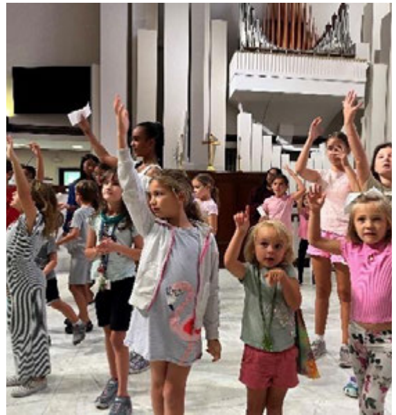
In June, Vacation Bible School took the children to where Jesus was born and grew up with the theme Hometown Nazareth, Where Jesus was a Kid.