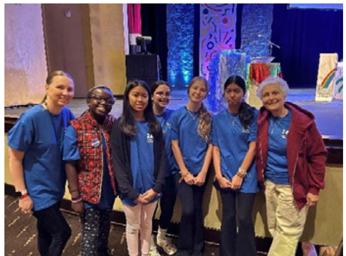
In July, our Middle School and High School Youth attended Montreat Events!