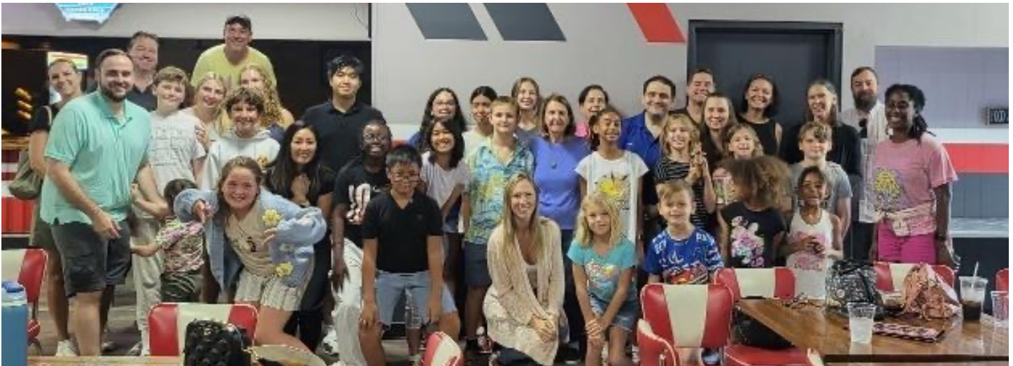
Our First Families went bowling in September, and had a fun afternoon of minigolf at PopStroke in November.