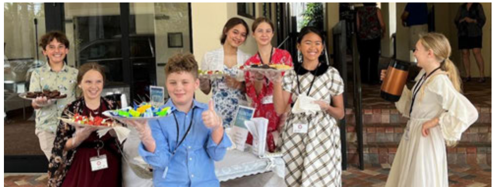
Throughout the year, the God Squad (5th grade on up) helped serve the church in many ways.