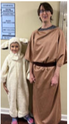
The year ended with our third annual "First Christmas", the Children's Christmas Pageant.