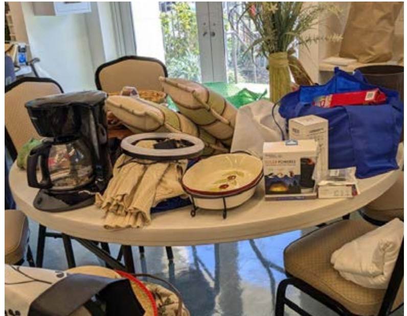
Holly House is a ministry of First Presbyterian Church of Delray Beach