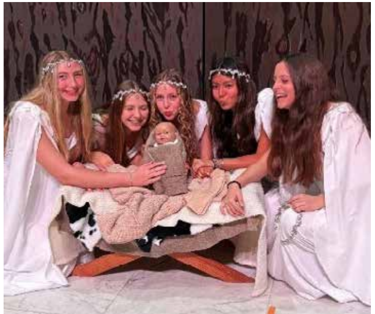
Christmas Pageant Teen Angels