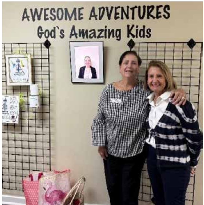
Our Sunday School Teachers