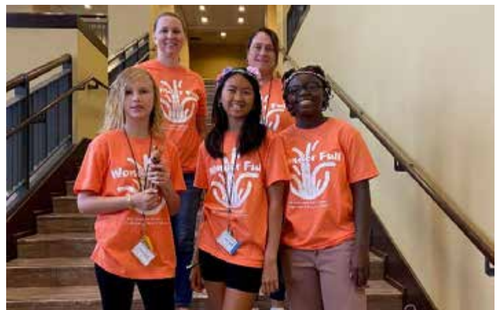
Middle School Montreat Trip