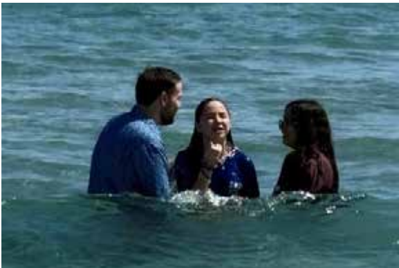
Special Events by the Sea