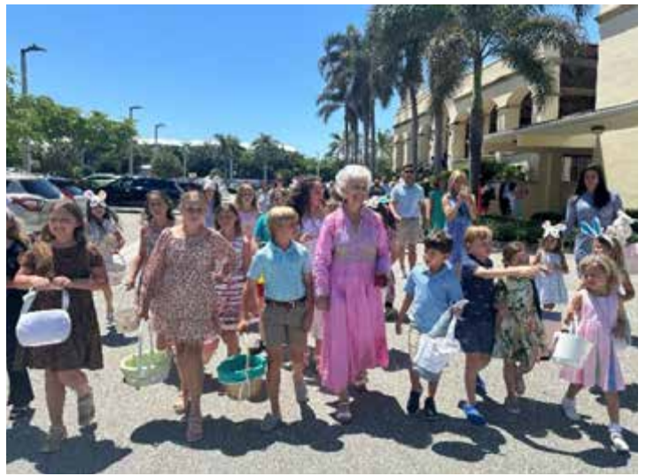
Easter Egg Extravaganza