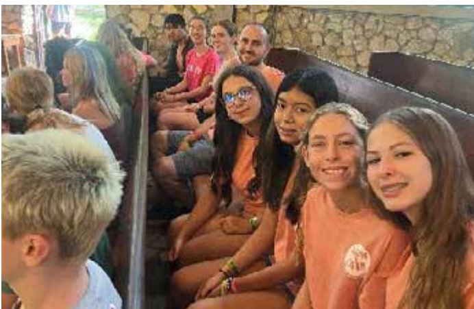
High School Montreat Trip