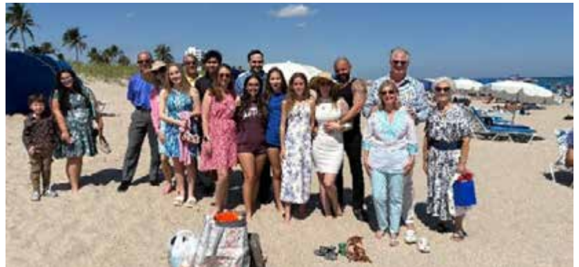
Special Events by the Sea