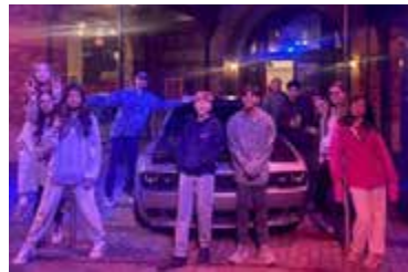
Rock the Universe