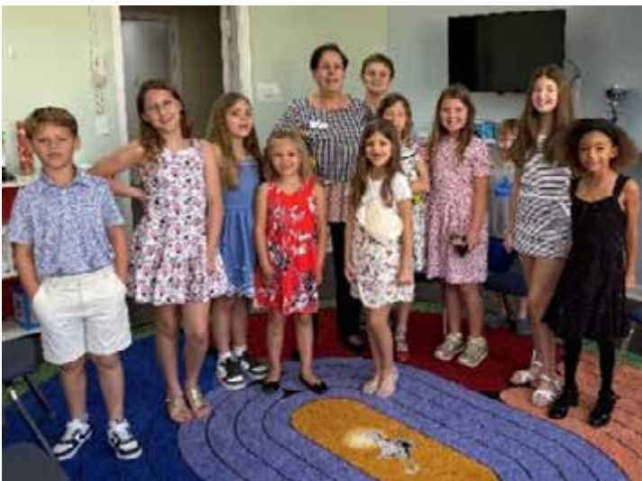
Children's Sunday School