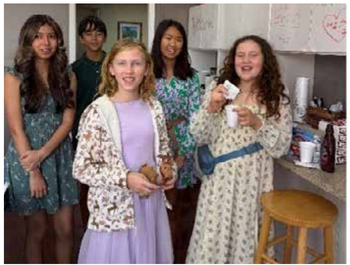
The God Squad