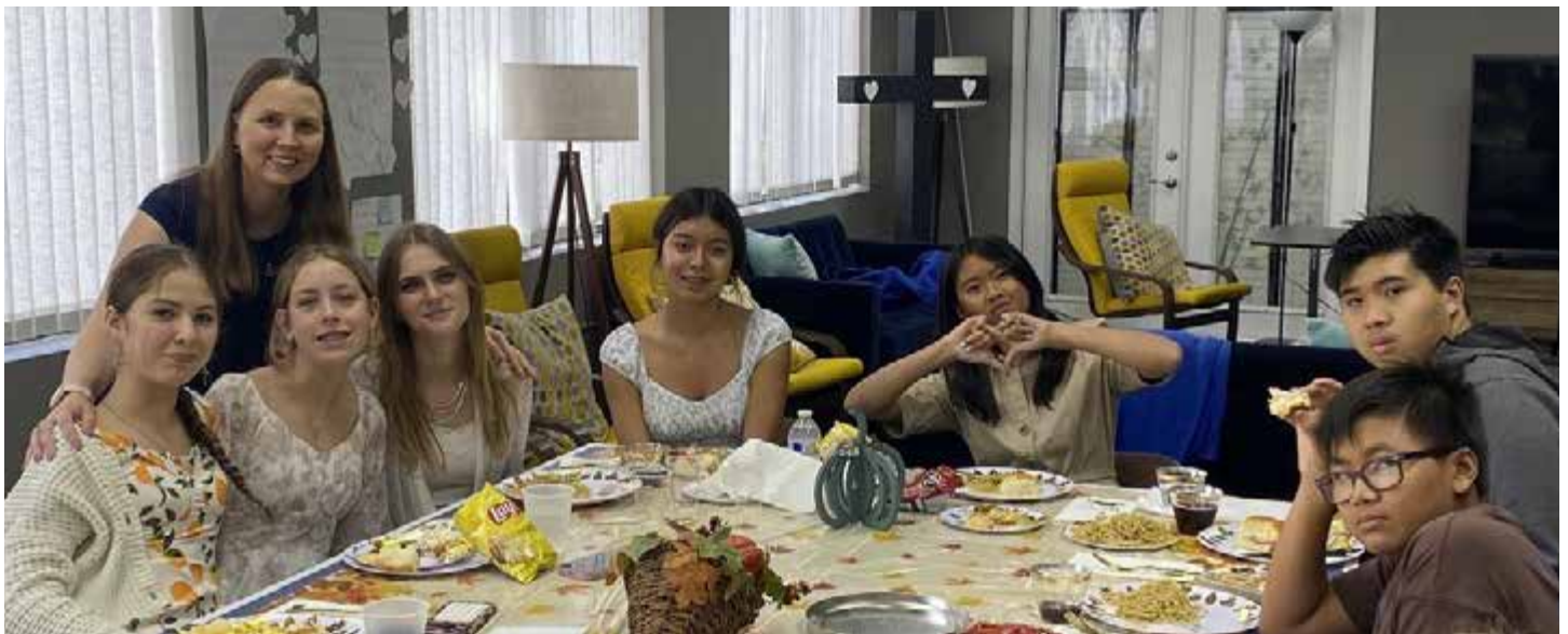
Youth Group Enjoying Friendsgiving