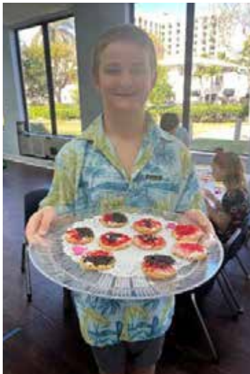
Serving the Church