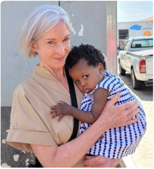
The little ones love to be held closely