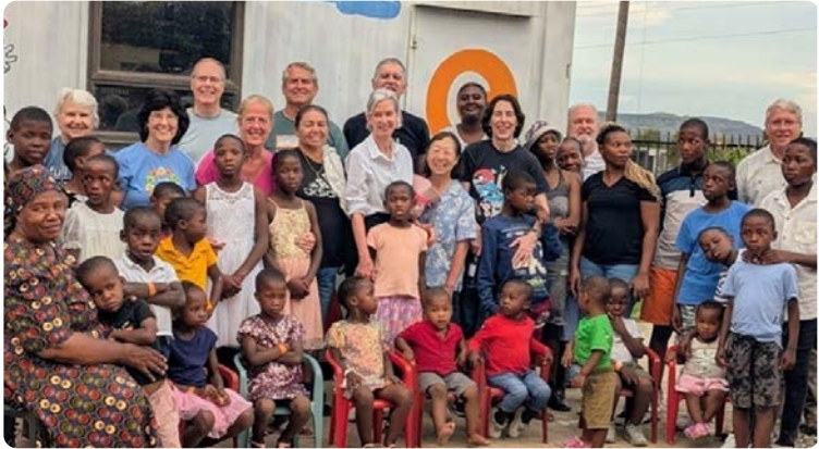
Volunteers, children, and staff from January 2026 Mission Trip to Ministry of Hope, Lesotho