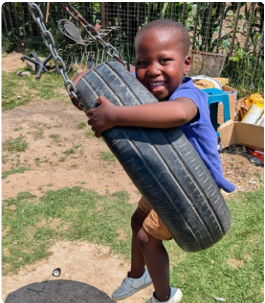
The new tire swing was a hit!